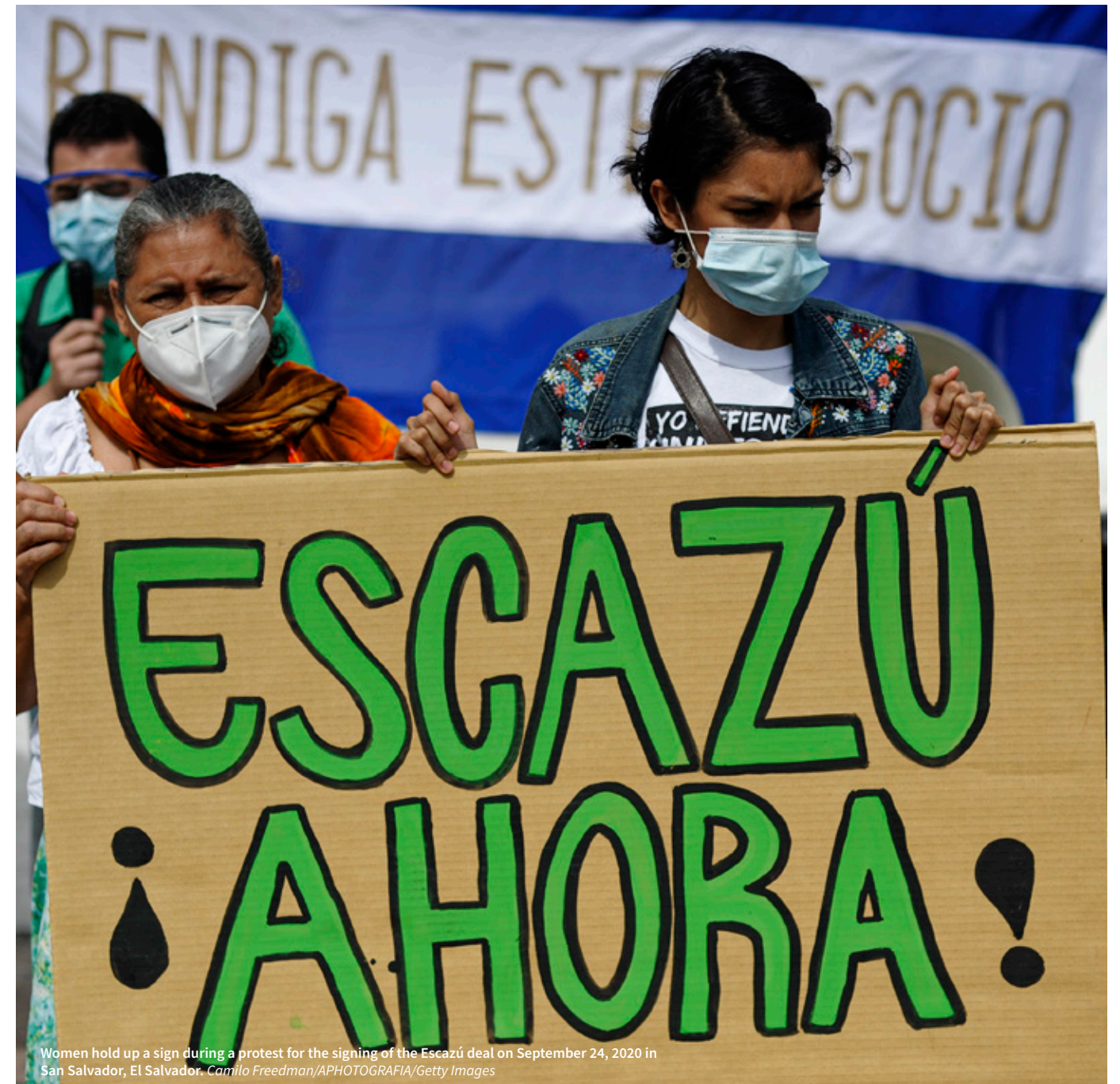
Women hold up a sign during a protest for the signing of the Escazú deal on September 24, 2020 in San Salvador, El Salvador.

In a promising development, on the 5th November Mexico became the 11th country to ratify the landmark Escazú Agreement for Latin America and the Caribbean – meaning it has now come into effect. The regional treaty sets out commitments for public participation in environmental management and standards for access to information and decision-making on environmental matters. Crucially, for the worst affected region it establishes legally binding commitments for protecting environmental defenders – the first time this has been included in an agreement of this kind.