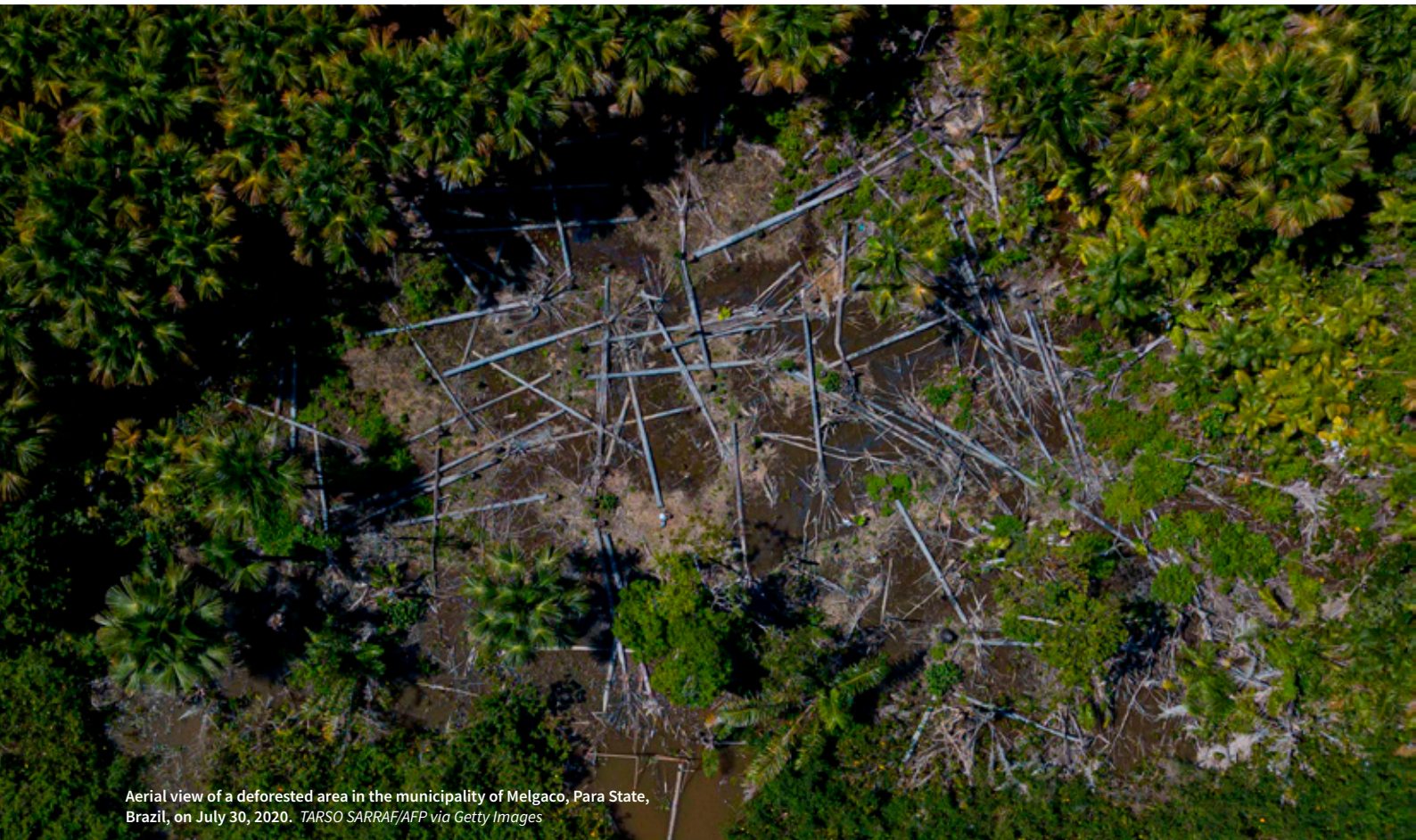
Aerial view of a deforested area in the municipality of Melgaco, Para State, Brazil, on July 30, 2020.