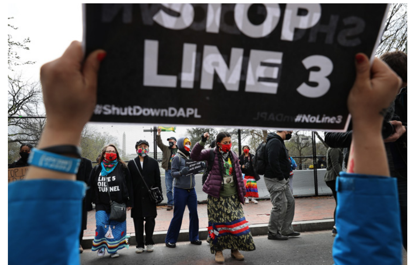
Indigenous environmental activists dance in a circle outside the White House to protest against oil pipelines. Organized by the Indigenous Environmental Network, the demonstrators called on President Joe Biden to 'Build Back Fossil Free' by stopping the Dakota Access and Line 3 pipelines.

> In North America, indigenous and climate campaigners secured a number of vital wins to protect the environment against oil extraction and transportation. In January the last of the major US banks committed to stop all financing of fossil fuel exploration in the Arctic. In February Canadian mining major Teck Resources pulled out of a US$15.7 billion tar sands mine that would have produced 260,000 barrels of crude oil bitumen per day at full capacity, citing climate change as one of the unresolved issues which meant that the project could not proceed. And in July a number of key decisions