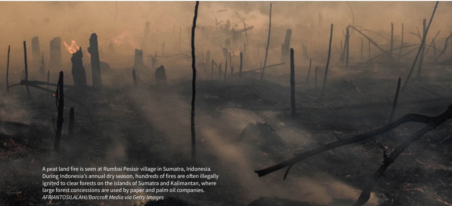
A peat land fire is seen at Rumbai Pesisir village in Sumatra, Indonesia. During Indonesia’s annual dry season, hundreds of fires are often illegally ignited to clear forests on the islands of Sumatra and Kalimantan, where large forest concessions are used by paper and palm oil companies.