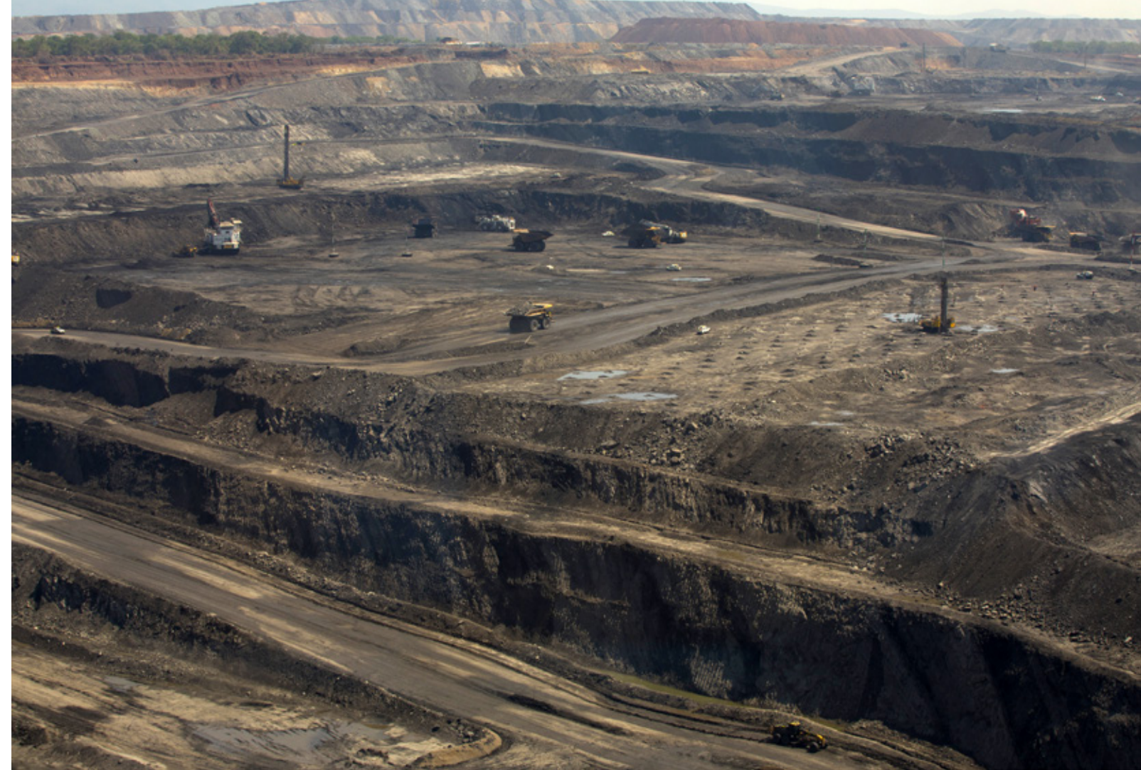
Machinery operating in the annex pit at the Cerrejon Coal Mine in Barrancas, La Guajira, Colombia.